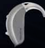
Power BTE - NEW!